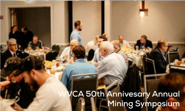
WVCA 50th Anniversary Annual Mining Symposium